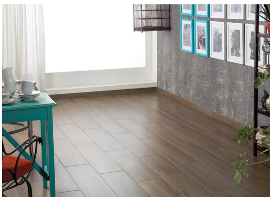
Figure 1 – Installed product